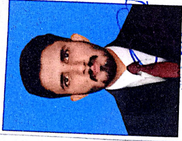
Punjab Pharmacy Council LAHORE