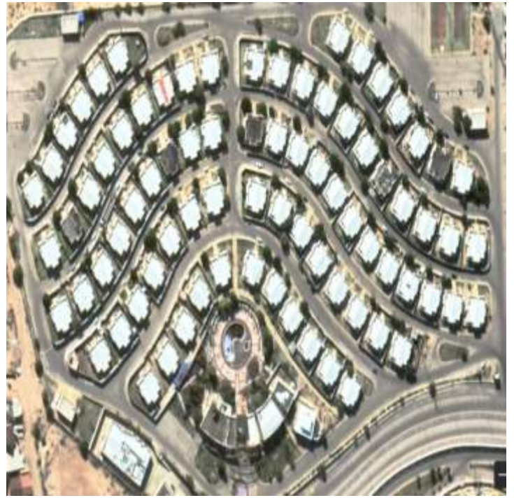
99 BEACH VILLAS & BEACH HOTEL