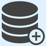
Analyze and Clean Data