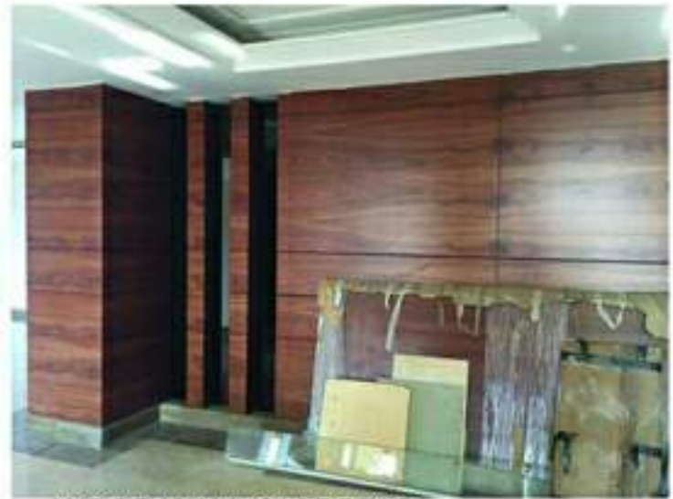
WOOD WALL CLADDING