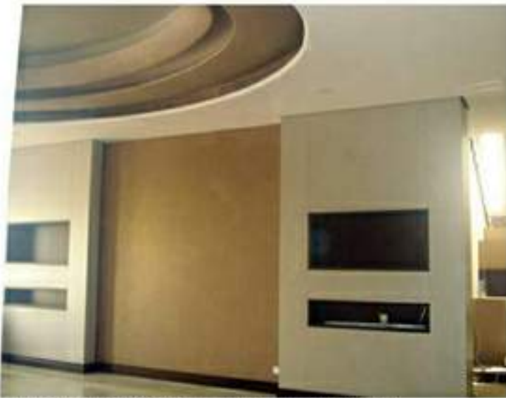
RECEPTION-1 NICHES AND FALSE CEILING DETAILS