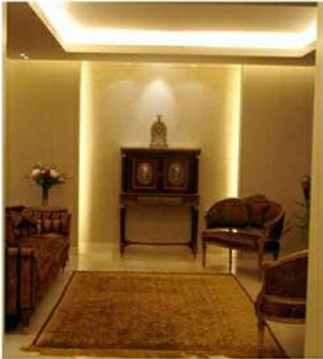
RECEPTION - 1