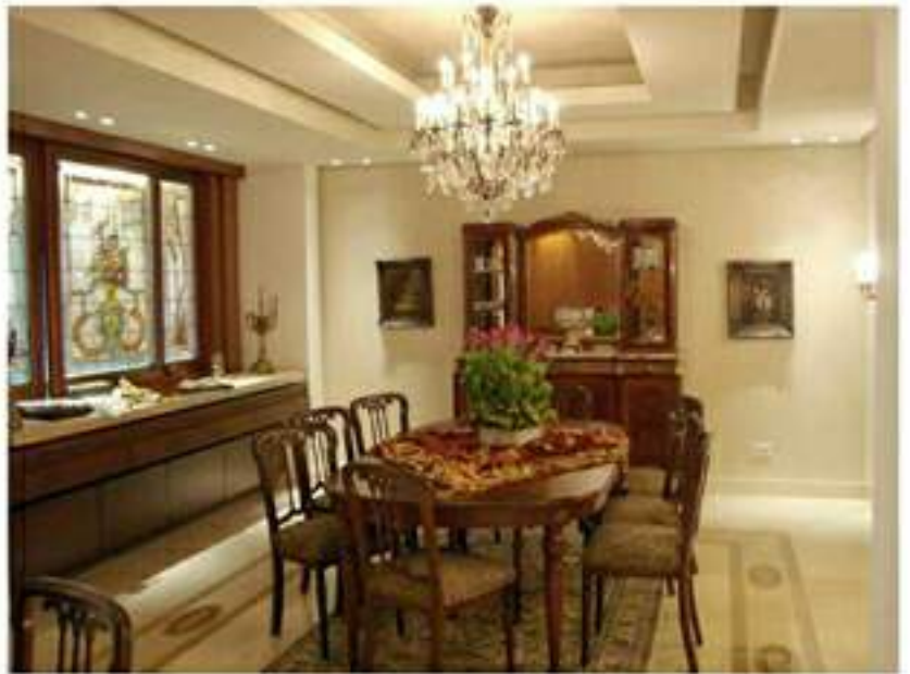
DINING ROOM - VITRIL / DESSERTS - FLOOR MARBLR DESIGN - F.CEILING