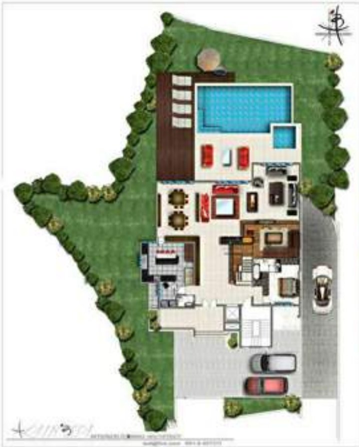
VILLA TOP VIEW