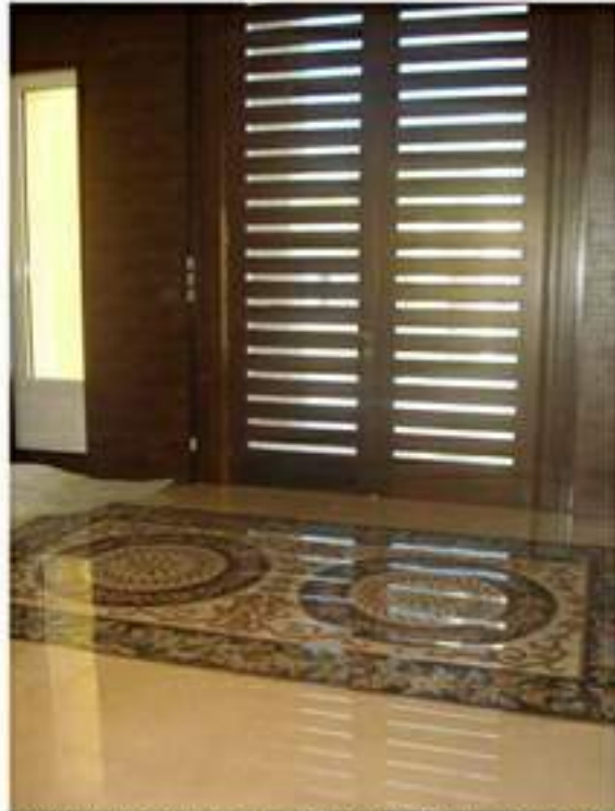
MAIN ENTRANCE DOOR AND MOSAIC FLOOR DESIGN