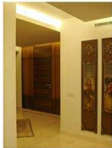
MAIN ENTRANCE FLUSH DOOR