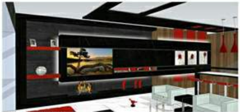
TV WALL DESIGN