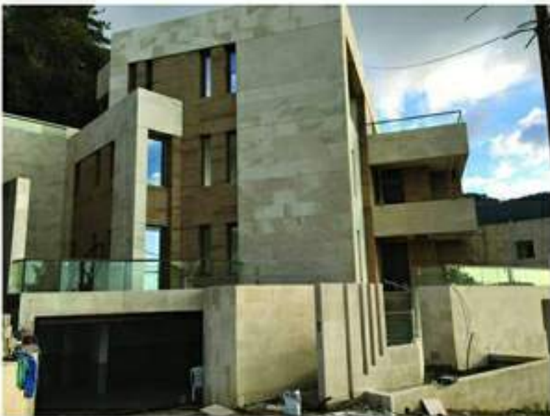
MAIN VILLA ENTRANCE