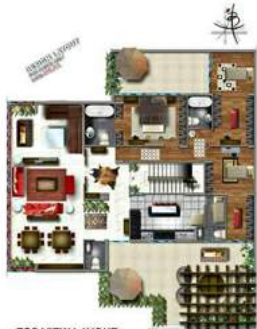
TOP VIEW LAYOUT