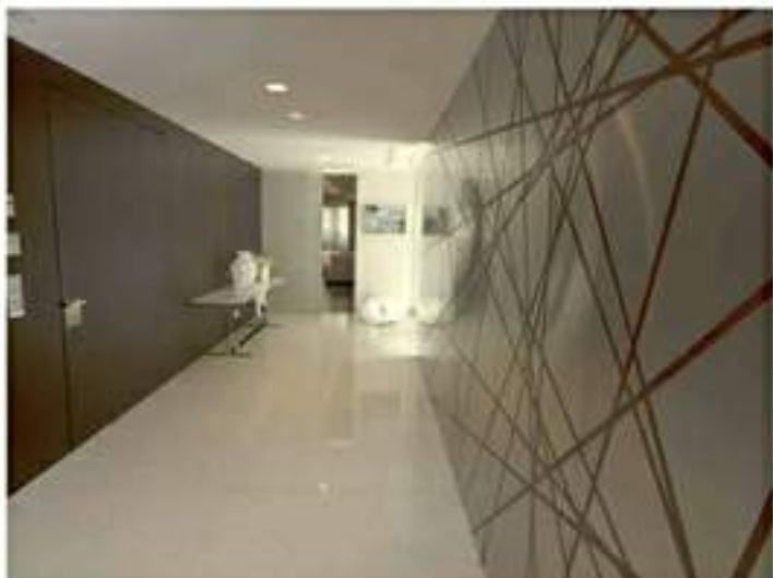
MAIN ENTRANCE - HIDDEN DOOR, S. STEET OPPOSIT WALL