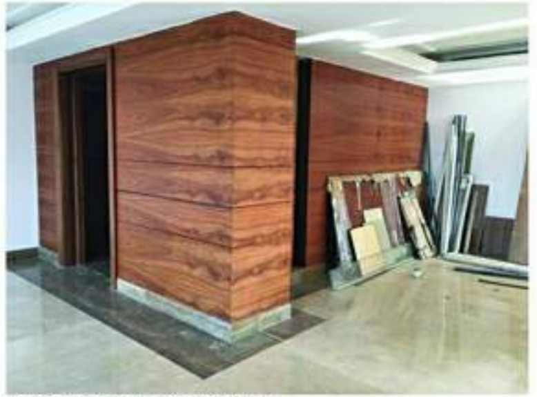
WOOD WALL CLADDING