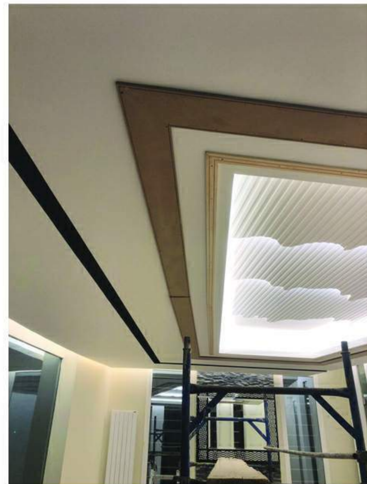
WOOD & GYPSUM WAVE CEILING