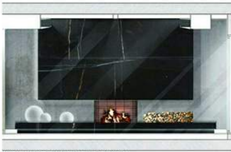
CHIMNEY WALL DESIGN