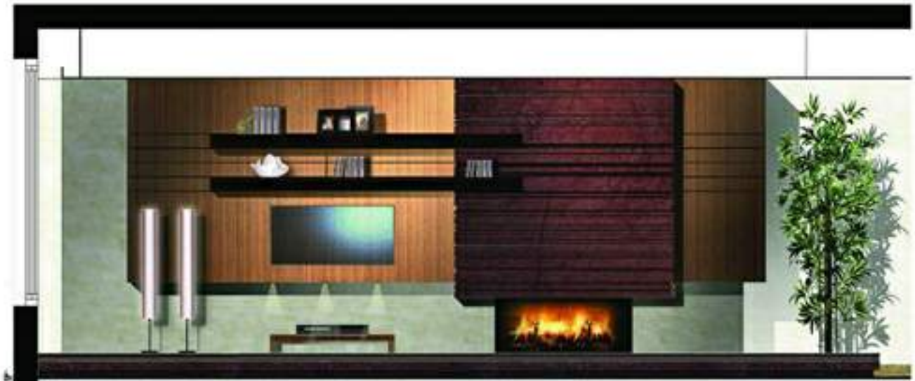
CHIMNEY WALL DESIGN