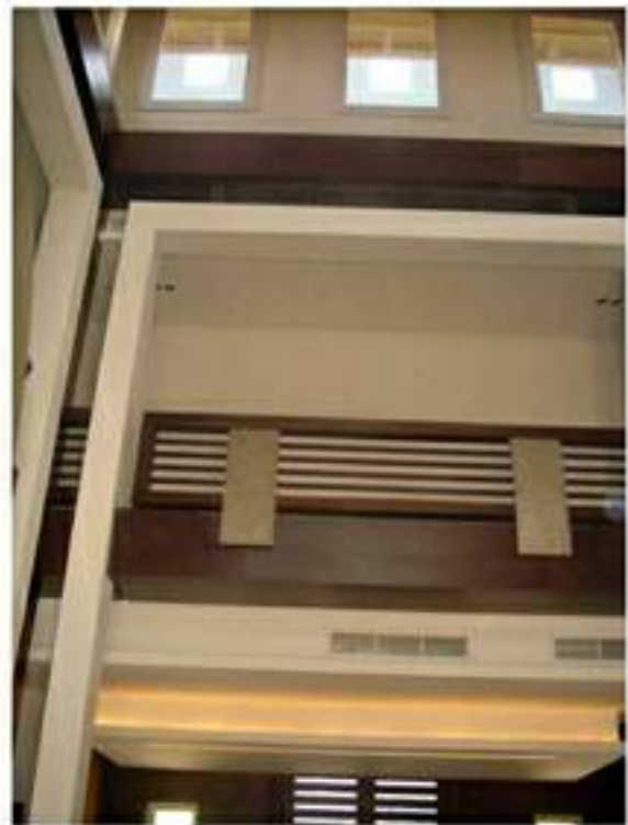
DOUBLE VOLUME - HANDRAIL DETAIL