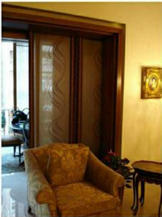
RECEPTION CURTAIN DETAILS