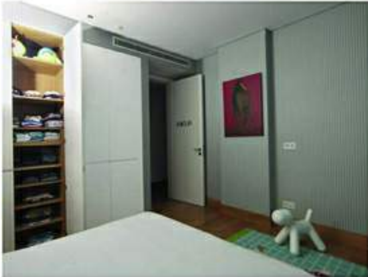
KIDS BEDROOM 2