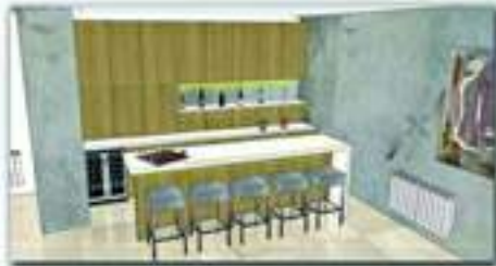
Mr. & Mrs. Karim Fallaha Multi-Purpose Area